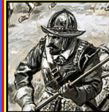
30 YEARS WAR (EUROPE)