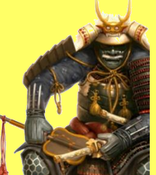
SAMURAI REVOLTS (JAPAN)