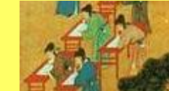
CHI. CIV. SER. EXAM