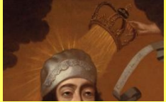
DIVINE RIGHT (EUR)