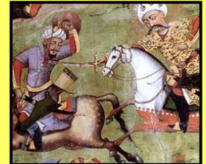
OTTOM vs. SAFAV. (MIDDLE EAST)