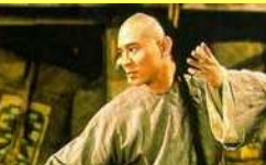
MANCHUS in CHINA