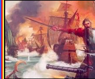
OTTOMAN v. EURO